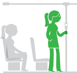
On the way to work