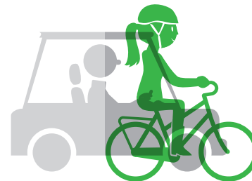
On the road